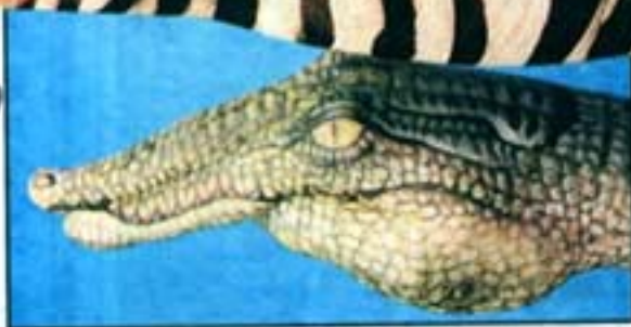
Very snappy...a croc definitely worth a photograph