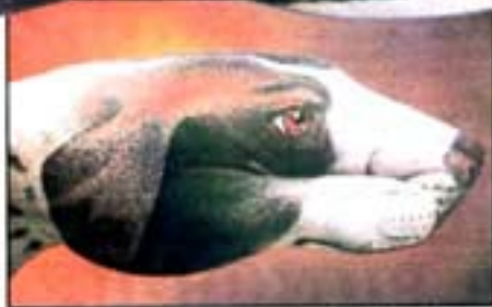
Dogged determination...an English pointer