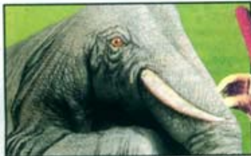
Jumbo appeal...elephant and a dove (right)