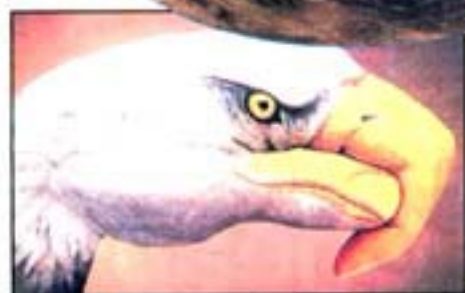
Top billing...Guido's eye-catching eagle